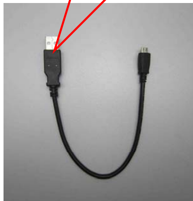
3. USB to Micro USB cable