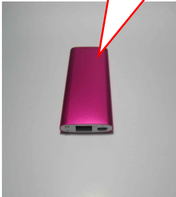
1 · AK1700 main body